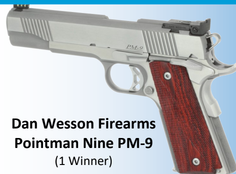
Dan Wesson Firearms Pointman Nine PM-9 (1 Winner)