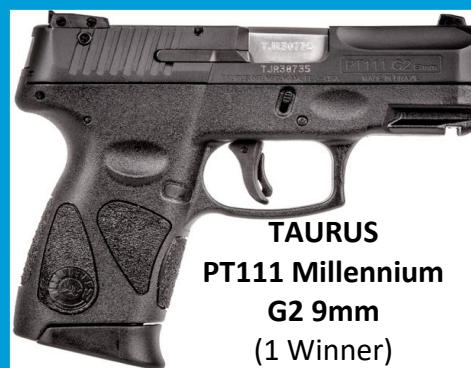
TAURUS PT111 Millennium G2 9mm (1 Winner)