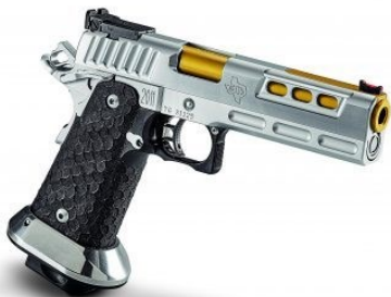
STI DVc Limited Island 2011 Pistol (1 Winner)