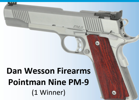
Dan Wesson Firearms Pointman Nine PM-9 (1 Winner)