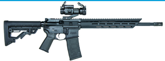
MOSSBERG MMR Tactical—Vortex Red/Green Dot Combo (1 Winner)