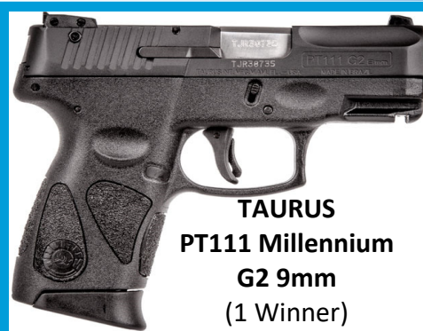
TAURUS PT111 Millennium G2 9mm (1 Winner)