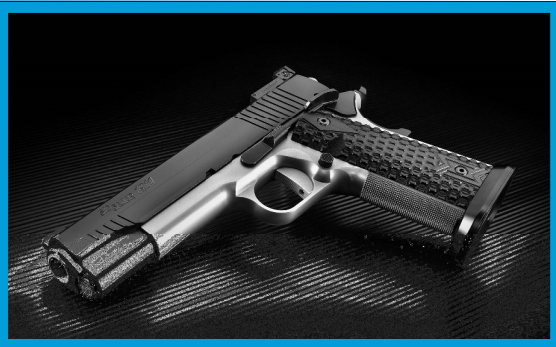
SIG SAUER 1911 .45 ACP Max Michel, Reverse 2-Tone, SAO, Adjustable Sights (1 Winner)